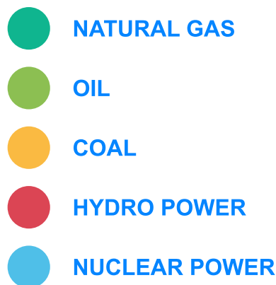
ELECTRICITY PRODUCTION 2000

Summarize the information by selecting and reporting the main features and make comparisons where relevant. Write at least 150 words.